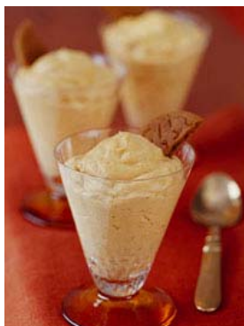
Ginger Pumpkin Mousse

Try this tasty looking Halloween treat!!